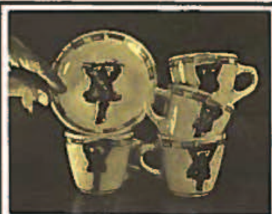
DISTINCTIVE PHILISTINE CHINA

RECONVERTED CHURCH FOR SALE. Desirable New England location. Call Alice. CH 5-4995.