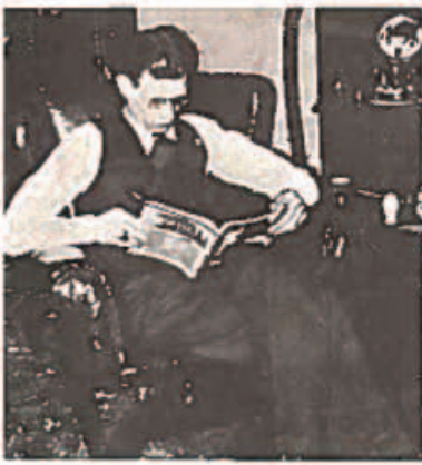
A Time to Reflect