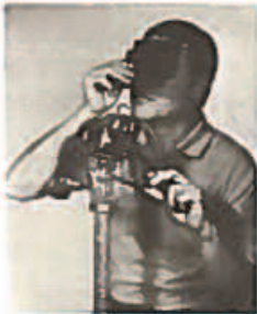
WM. B' EERDZONDERS PUBLISHING CO. Bland Rapids, Michigan

We're fighting for a purpose. Our country, right or wrong; On floors or in the jungle, The white makes right, not wong.