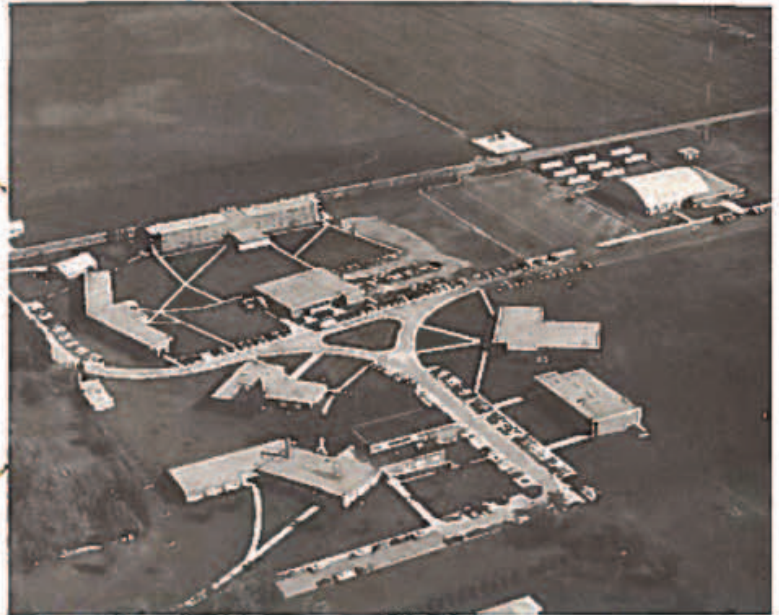
Mid Fields of Golden Corn

As evidenced by these typical campus scenes pictured here, Warp College is a college where we don't allow your son or daughter to be introduced to strange ideas. Quote, unquote.