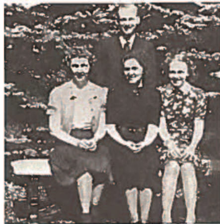
The Odds are Good