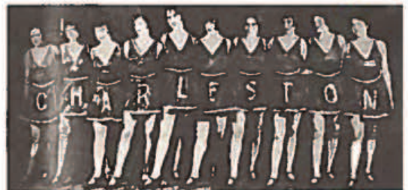
Unity and Harmony