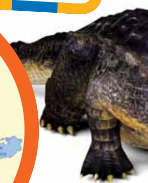
ILLUSTRATION BY SCOTT HOLLADAY