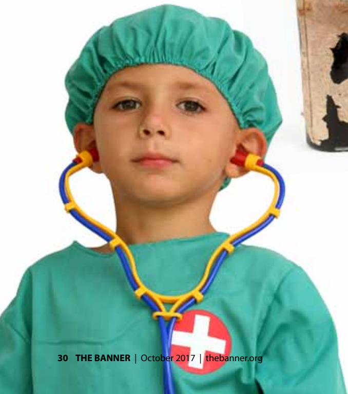
ILLUSTRATION BY SCOTT HOLLADAY